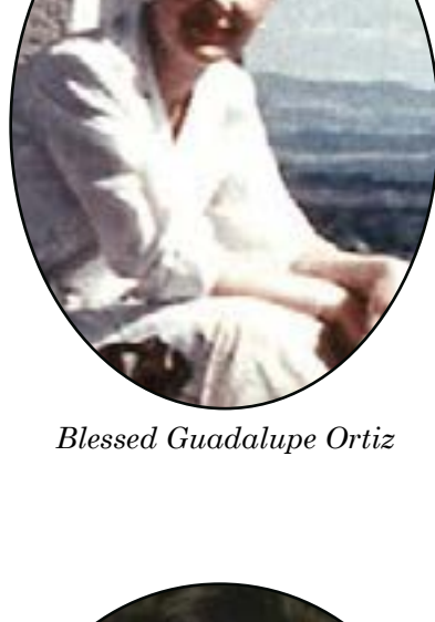
Blessed Guadalupe Ortiz

Additionally, the Prelate offered a meditation on February 14. He began by thanking God for the blessings of the past 90 years, noting, "You need to give thanks (we all do) because on that 14 February 1930 each of you was in the mind of God, part of his plans, from all eternity.... We are also grateful thinking of the thousands and thousands of women of Opus Dei who are in heaven, having reached the goal.... Referring specifically to the founding of the women's section and the gratitude that we should have especially on this day, our Father said to his daughters: "The best way to be grateful is to be happy, calm, serene, balanced; praying, working, smiling, and being grateful that in the Work we are never alone."